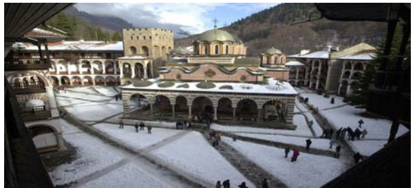
The Rila Monastery in southern Bulgaria.