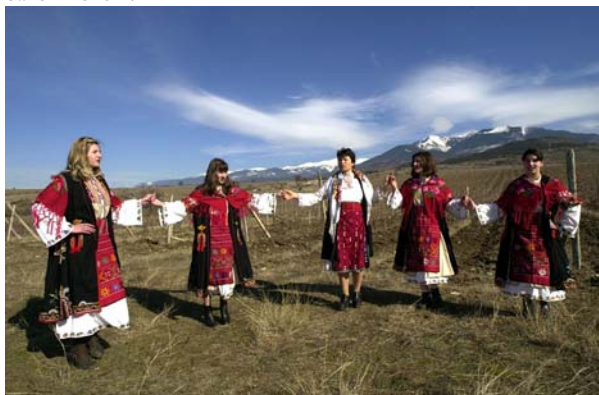
Bulgarian farmers dressed in traditional costumes performing a ritual during a traditional national wine festival for a good wine harvest in the village of Ilindenci, some 120km south of Sofia.

“After considering many markets, many on the outside looking more appealing, Bulgaria offered far too many benefits for us to ignore. Regular visits and in-depth research along with the development of long-term relationships means we have a very stable future that will only grow with EU enlargement” – Sarenmo UK.