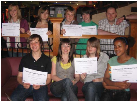
Students receiving their certificates at Gripple