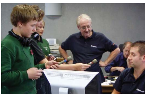
Students recording at Gripple